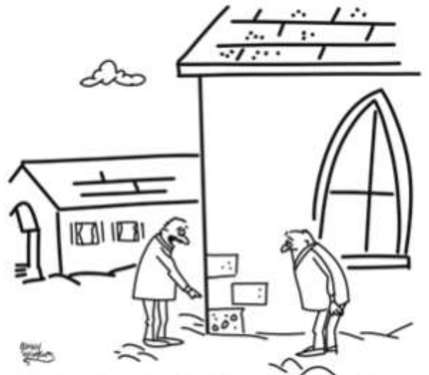
"Very few people realize this, but the cornerstone of this church is actually a fruitcake given to me by Ethel Mabeline during the Christmas of '72."

Roll out crescent rolls on cookie sheet. (do not separate). Sprinkle dough with dill. Place cream cheese on center and sprinkle with dill. Wrap roll dough over cheese, pinching to seal. Bake 350° for 15 minutes. Cut open in center and serve with crackers for dipping.