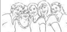
Global Methodist Women

The Global Methodist Women met on November 9th for their monthly meeting.