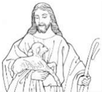
KNOWING JESUS AS THE GOOD SHEPHERD & SHARING THE RISEN CHRIST WITH ALL.